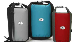
Dry Bag DRB-001