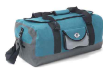
Team Bag TMB-001