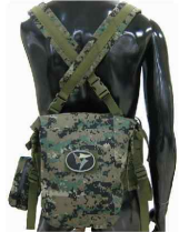
Mission Vest MV-003