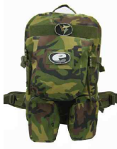
Medical Bag MD-001