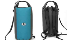
Dry Bag DRB-002

*** Please contact us; if you need more information about Seoul Internationals BACK-PACK products!