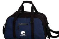
Team Bag TMB-002