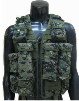
Mission Vest MV-001