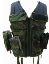
Mission Vest MV-002