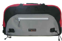
Team Bag TMB-003